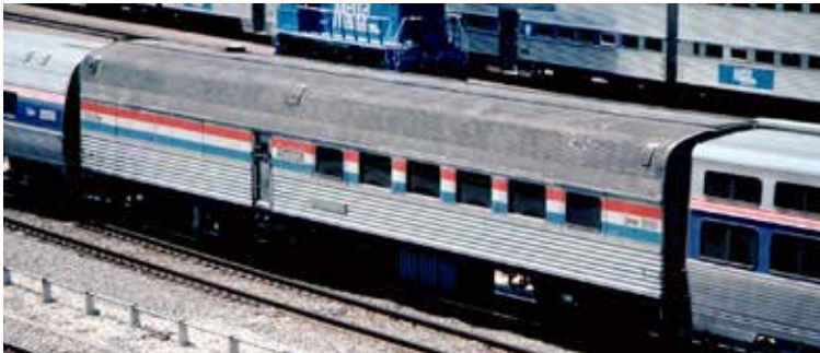
Amtrak Heritage Diner in Phase III trim.

I guess that's it for now. Our next business meeting will be on 20 August 2023 at 2PM at my house (500 East Maple Road, Linthicum Heights, MD 21090). I hope to see everyone there! Until then, be safe and enjoy the hobby, your family, your friends, and everything else that brings you joy!