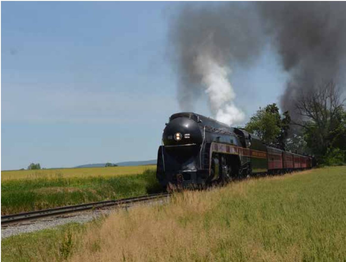
Classic steam rolling at Strasburg. N&W 611

BANTRAK was founded in 1983 as the Greater Baltimore N-Scale Associates. Begun as a “round robin” group to share skills and experiences, we have expanded our focus to include participation in many diverse activities to promote model railroading in general and N-Scale model railroading in particular. Activities include participation in local, regional and national shows, meets and conventions. BANTRAK membership includes membership in the national NTRAK organization.