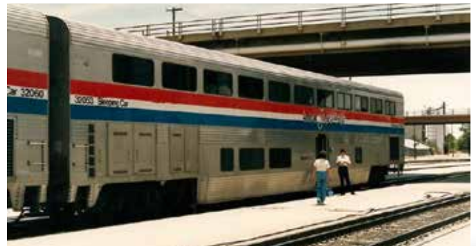
Amtrak Superliner Sleeping Car in Phase III trim.