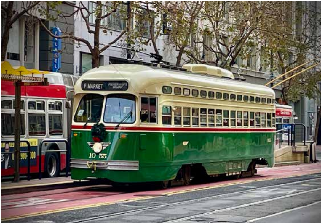
San Francisco, CA.

BANTRAK was founded in 1983 as the Greater Baltimore N-Scale Associates. Begun as a “round robin” group to share skills and experiences, we have expanded our focus to include participation in many diverse activities to promote model railroading in general and N-Scale model railroading in particular. Activities include participation in local, regional and national shows, meets and conventions. BANTRAK membership includes membership in the national NTRAK organization.