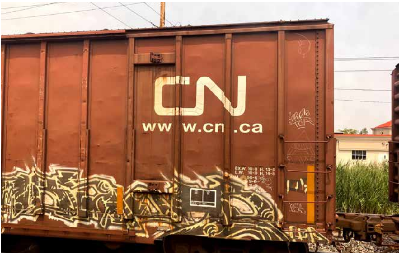
A great closeup of 1 to 1 weathering somewhere in upstate NY

BANTRAK was founded in 1983 as the Greater Baltimore N-Scale Associates. Begun as a “round robin” group to share skills and experiences, we have expanded our focus to include participation in many diverse activities to promote model railroading in general and N-Scale model railroading in particular. Activities include participation in local, regional and national shows, meets and conventions. BANTRAK membership includes membership in the national NTRAK organization.