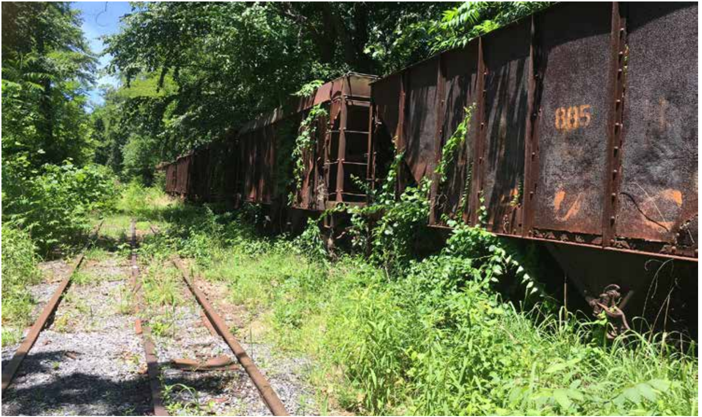
East Broad Top Mt Union yard, June, 2022. The hopper cars have not moved in 66 years. The yard was dual gauge, standard and narrow gauge, thus the three rails.

BANTRAK was founded in 1983 as the Greater Baltimore N-Scale Associates. Begun as a “round robin” group to share skills and experiences, we have expanded our focus to include participation in many diverse activities to promote model railroading in general and N-Scale model railroading in particular. Activities include participation in local, regional and national shows, meets and conventions. BANTRAK membership includes membership in the national NTRAK organization.