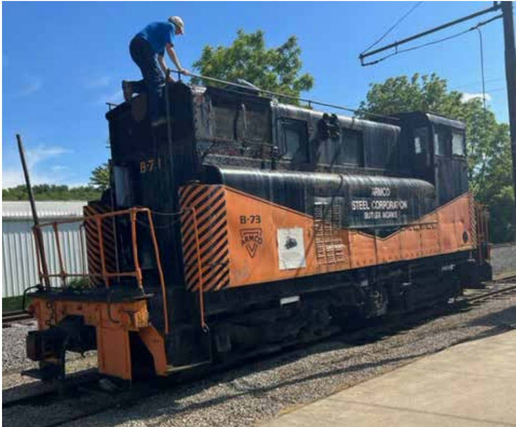
Trolley Museum @ Washington PA.

BANTRAK was founded in 1983 as the Greater Baltimore N-Scale Associates. Begun as a “round robin” group to share skills and experiences, we have expanded our focus to include participation in many diverse activities to promote model railroading in general and N-Scale model railroading in particular. Activities include participation in local, regional and national shows, meets and conventions. BANTRAK membership includes membership in the national NTRAK organization.