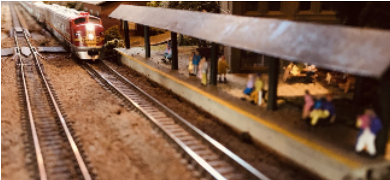
El Capitan approaches a station during the B&O FOT show.