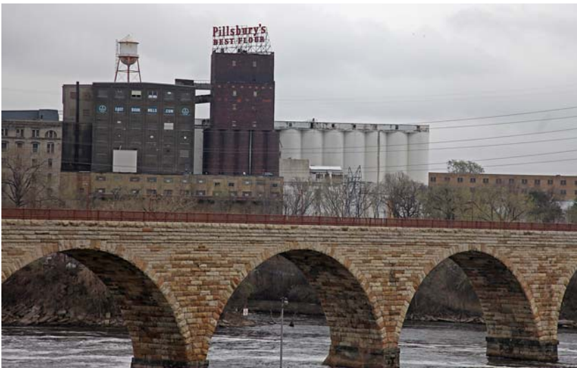
The look at the new Pillsbury Module that is I am building for my wife this coming year.